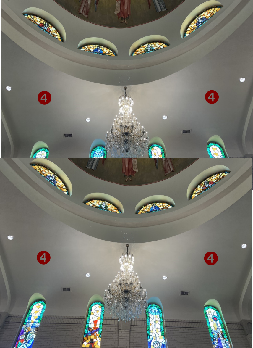
4 4 Evangelists (Matthew, Mark, Luke & John) $10,000 (each)