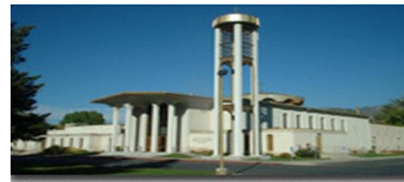
Prophet Elias Church