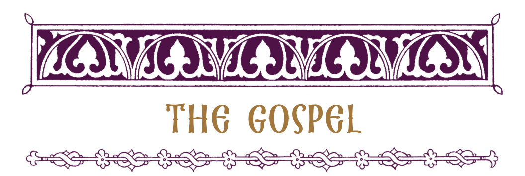
The reading is from the Holy Gospel according to Mark (8:34-38; 9:1)

The Lord said: "If anyone wishes to come after me, let him deny himself and take up his cross and follow me. For whoever would save his life will lose it; and whoever loses his life for my sake and the gospel's will save it. For what does it profit a man, to gain the whole world and forfeit his life? For what can a man give in return for his life? For whoever is ashamed of me and my words in this adulterous and sinful generation, of him will the Son of man also be ashamed, when he comes in the glory of his Father with the holy angels." And he said to them, "Truly, I say to you, there are some standing here who will not taste death before they see the kingdom of God come with power."