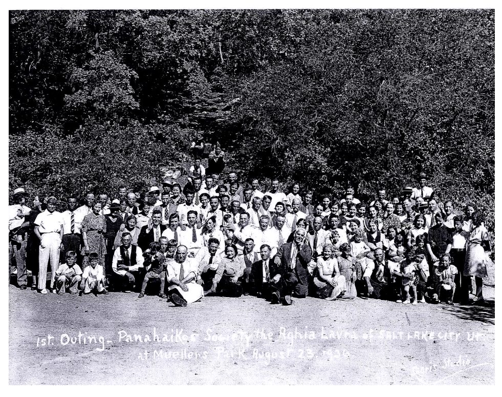
The first outing of the Panahaikos Society was held on August 23, 1936.