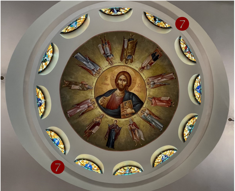
7 Dome Décor $5,000