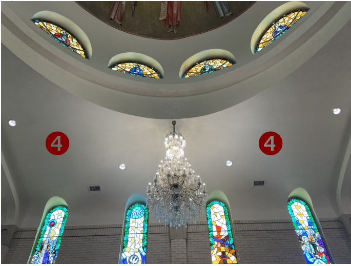
4 4 Evangelists (Matthew, Mark, Luke & John) $10,000 (each)