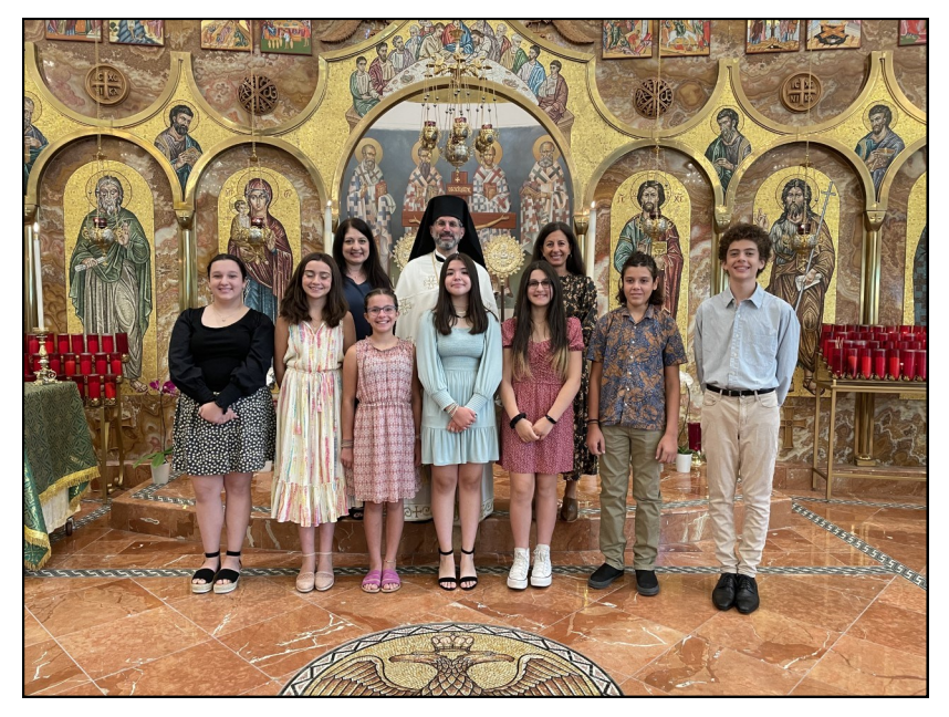
Congratulations to our Junior GOYA Executive Board!