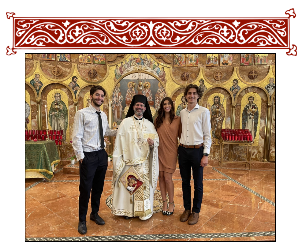
Thank you to the Minotavros Youth for fulfilling their $10,000 pledge for our Platytera!