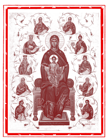
THE TREE OF JESSE