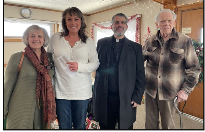
Women's Rescue Mission