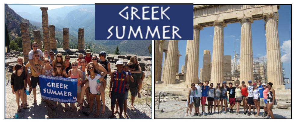
Summer 2023 is just around the corner! Are you looking for a culturally enriching experience?

For over 50 years, the <u>American Farm School</u> in Thessaloniki, Greece has welcomed students from all over the world for its <u>Greek Summer</u> program, an odyssey for high school students that combines culture, travel, and community service. The program will include: