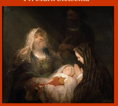
The greatest Christmas gift of all is a name.

There was a time when parents gave a lot of consideration to naming their children. Nowadays, it seems, the trend is to spill a bowl of alphabet soup and see what you come up with. Traditional names all have meanings, and there was a time when people concerned themselves with such things.