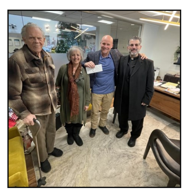
The Other Side Academy